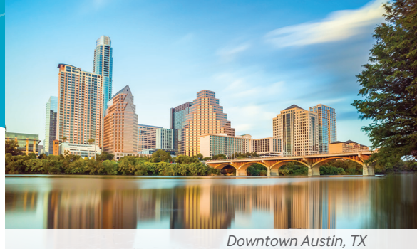
Downtown Austin, TX

In 2016 Forbes Magazine's 4 list of "Best Cities for Jobs," the Austin metropolitan area earned sixth place nationally. With a close proximity to the University of Texas at Austin, the region benefits from a steady source of engineering and computer science graduates to feed the areas technology and defense industry employers.